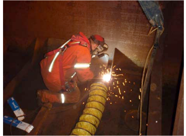
Hull Repairs – Confined Space Entry