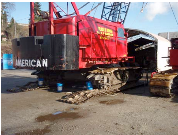
Undercarriage Repairs - American 100T Crane